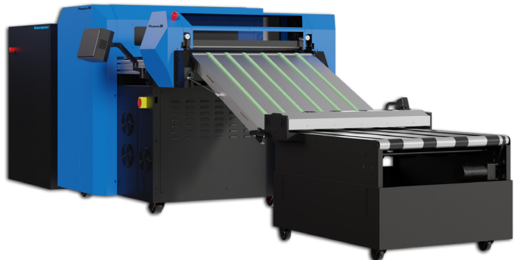
Phoenix 30 with interface conveyor

The Phoenix is a revolutionary new coating/priming system that is the most modular system available. Our system utilizes IOTech4 allowing you to view real time statistics for information like job run time, number of impressions, coating usage, and much more. Maximize efficiency and minimize operator error by tracking jobs via part number.