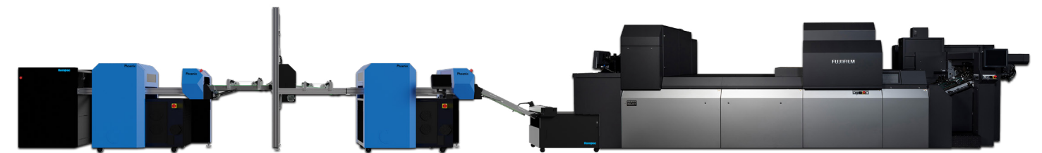
Phoenix 30 Duplex in-line system on Fujifilm J Press 750S Sheetfed Inkjet Press

The Phoenix Duplex is a state-of-the-art system that is capable of coating and priming a wide range of substrates. With its advanced sheet turning technology, the system can handle a wide range of substrates, from lightweight to heavy-weight, and provide consistent coating quality across the board. The system's innovative design allows for seamless integration into existing production lines, making it a cost-effective solution for many printing and packaging operations. Additionally, its compact size and minimal maintenance requirements make it an ideal choice for small to large-sized businesses looking to increase their production capabilities. The Phoenix Duplex's advanced system enables precise control over the coating and priming process, ensuring consistent and uniform coating thickness and coverage. It also features automatic cleaning and maintenance functions, reducing downtime and ensuring maximum uptime.