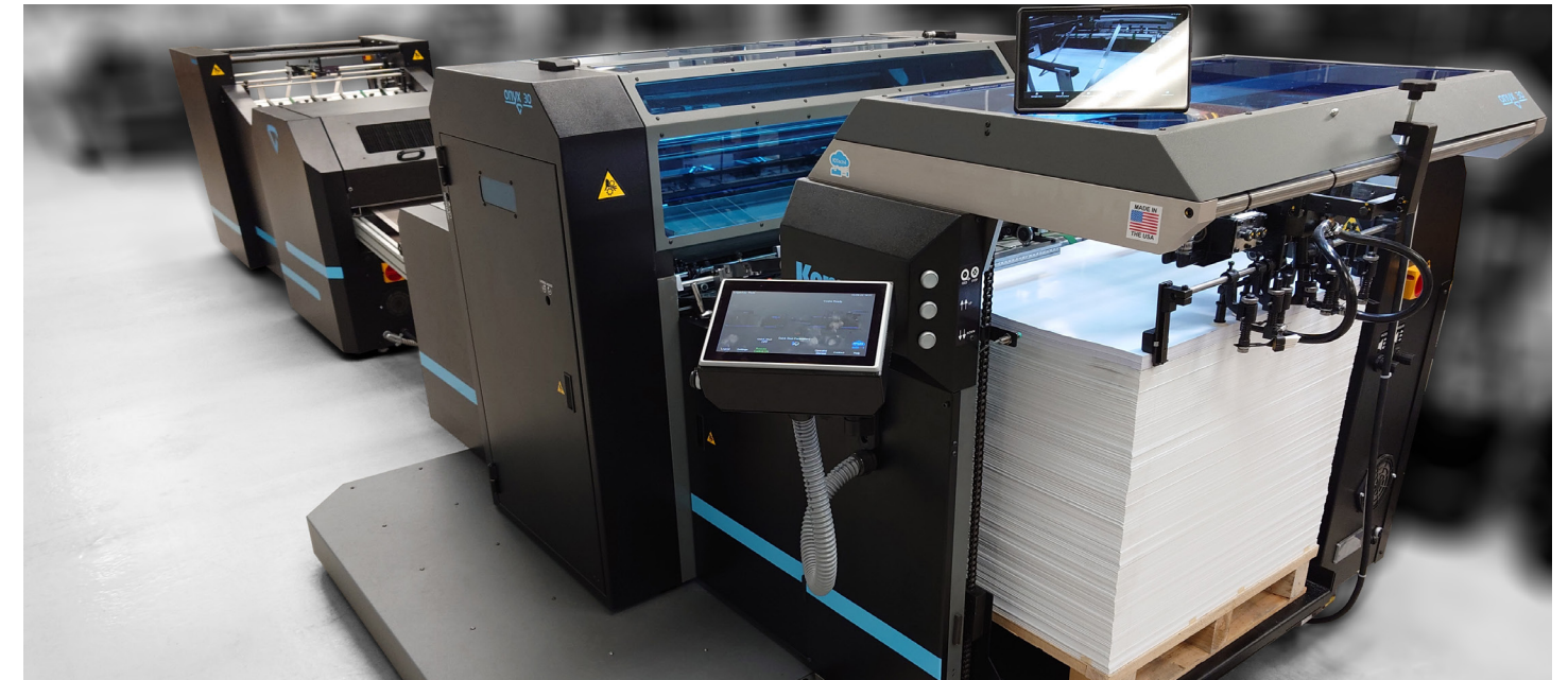
Onyx 30, shown with feeder and stacker

Patented Kompac Coating System Patented Hybrid Chambered Anilox System Patent Pending Duplexing System Patented Kompac Vac Cleaning System Patented Infra-red Drying System Hybrid IR Drying System Corona Treating (Available on Phoenix Only) IOTech4 (Preset Jobs & Track, Remote Troubleshoot)