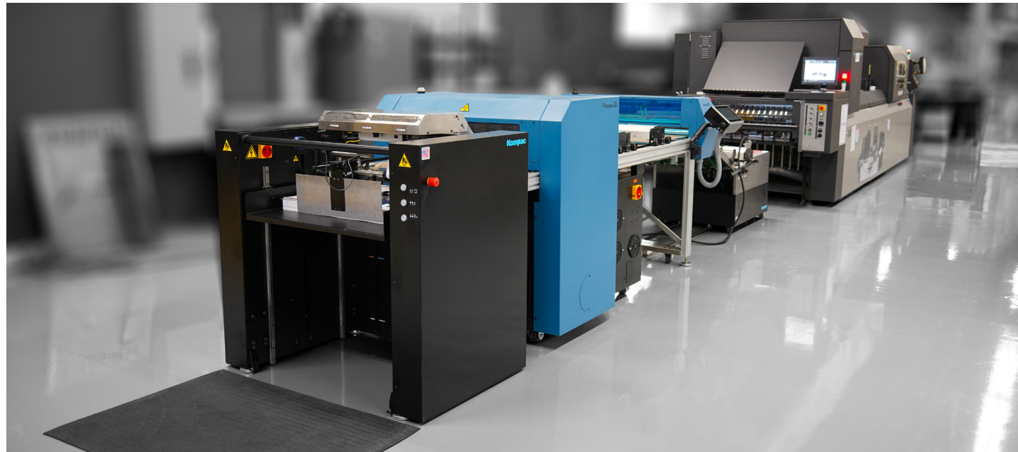
Phoenix 30 in-line system on Fujifilm J Press 750S Sheetfed Inkjet Press